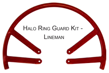
HALO RING GUARD KIT - LINEMAN