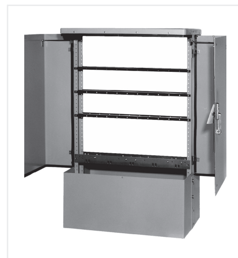
UPCBD8000 (front and rear doors open)

** Use when pad mounting is not desirable.